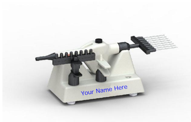
Multi-tool Aspiration Handset