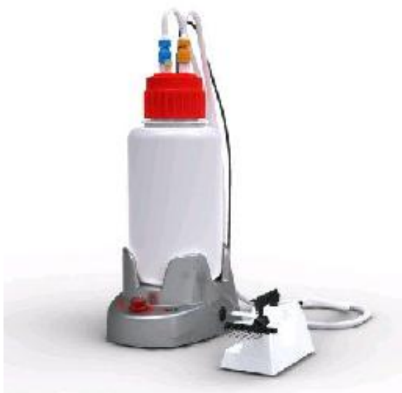
Precision Vacuum System